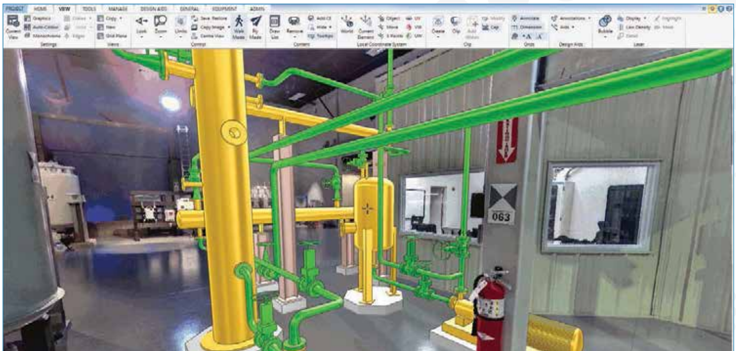
Photorealistic BubbleView™ laser scan viewing technology in AVEVA E3D enables piping design to be carried out in the context of the as-built facility